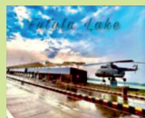
Futala Lake, Ambazari Lake