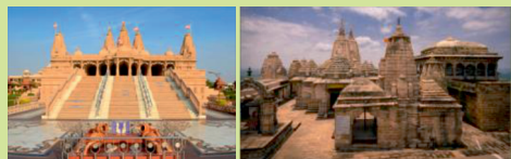
Akshardam Temple, Ramtek Temple